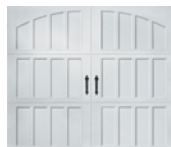
N1 • NORTHAMPTON CLOSED ARCH