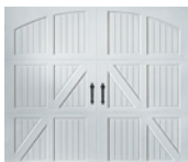
L1 • LUCERN CLOSED ARCH