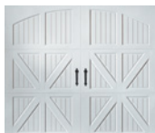
S1 • SANTIAGO CLOSED ARCH