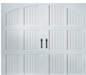
T1 • TUSCANY CLOSED ARCH