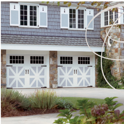
Santiago design with Madeira windows in True White/Gray with Blue Ridge handles and hinges

From a distance, you see wood. Up close, it's sturdy, durable, low-maintenance steel. The Amarr Classica collection offers precision-engineered doors with clean, classic carriage house style, plus the functionality of traditional garage doors. Unique three-section designs help deliver an authentic carriage house look, combining timeless style with today's technology and energy efficiency.