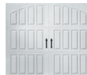
B1 • BORDEAUX CLOSED ARCH