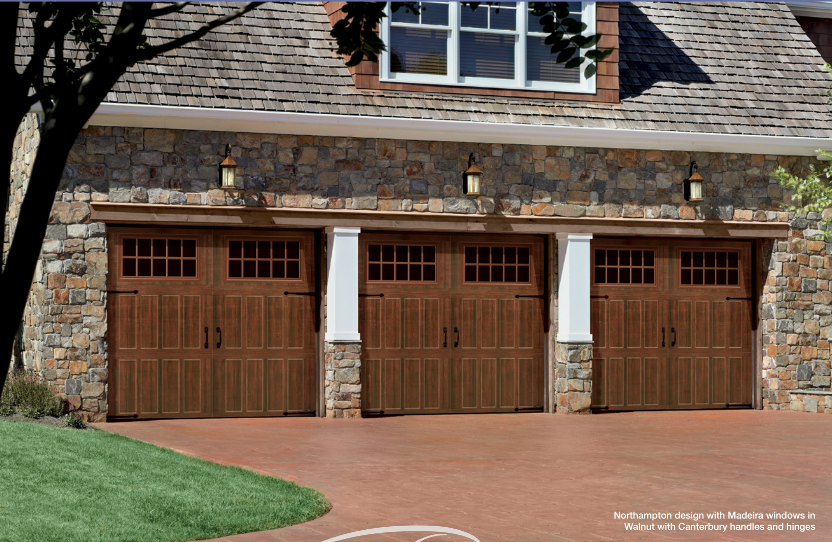
Northampton design with Madeira windows in Walnut with Canterbury handles and hinges