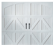
V1 • VALENCIA CLOSED ARCH